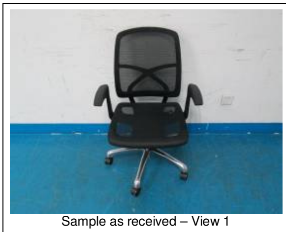
Sample as received – View 1