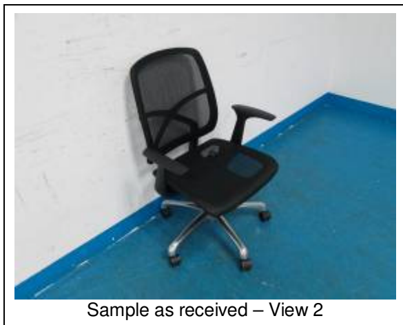
Sample as received – View 2